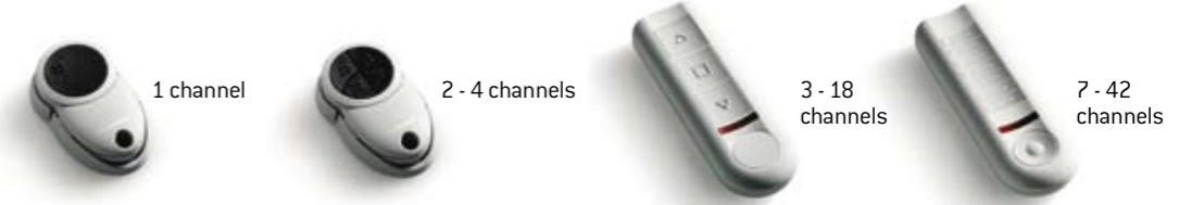
■ Hand transmitters powered by batteries