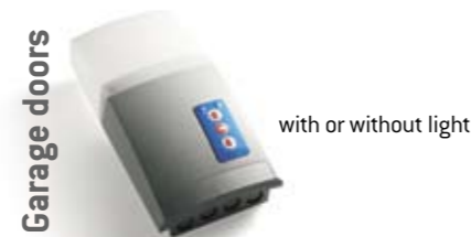
■ Radio control units for garage doors