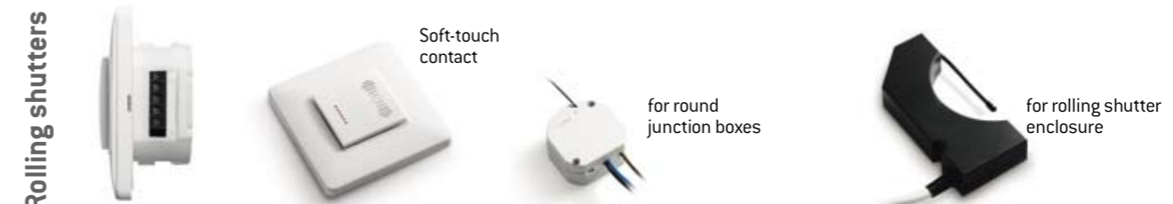
■ RF control units for motors