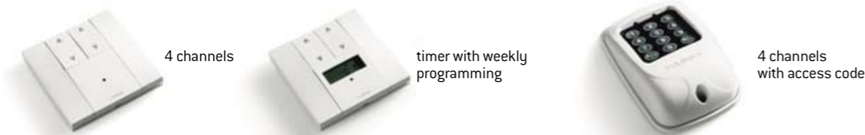
■ Wall transmitters powered by batteries