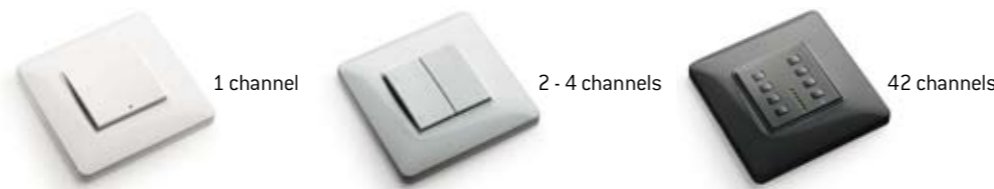
■ Wall transmitters powered by batteries