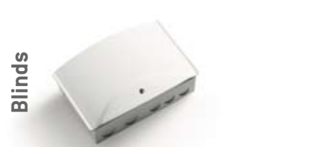
■ Radio control units for blind motors