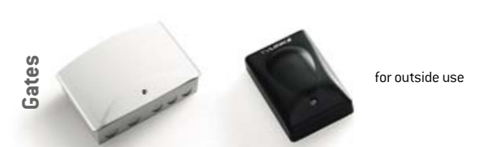
■ Radio receivers for gates

It can be used with a photocell safety edge and/or a 8.2 kOhm safety edge for garage doors (for houses and for factories) and motor operated gates