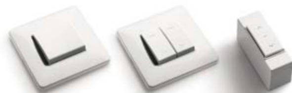
■ Mechanical push-buttons for rolling shutters