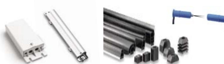
■ Bi-directional radio safety system for garage doors (the spiral cable is not necessary)

It can be used with a photocell safety edge and/or a 8.2 kOhm safety edge for garage doors (for houses and for factories) and motor operated gates